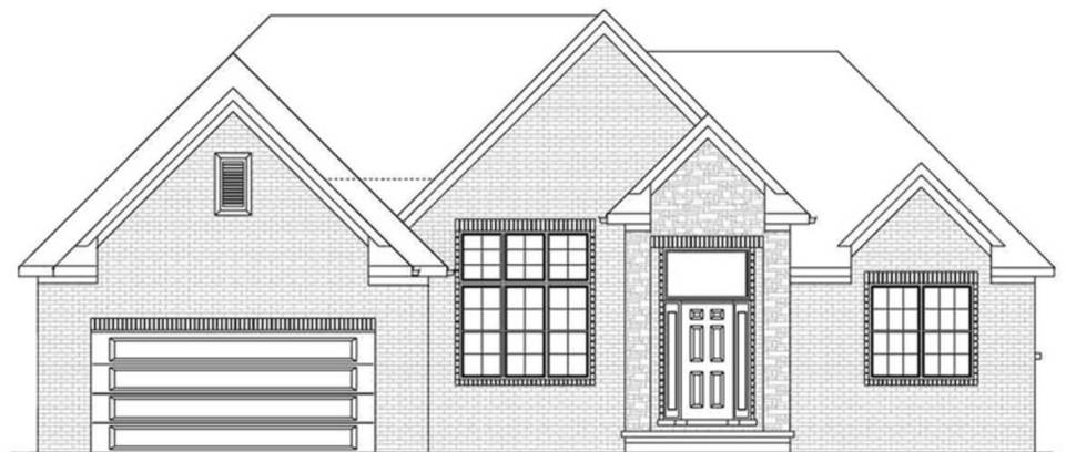
FRONT ELEVATION "C"