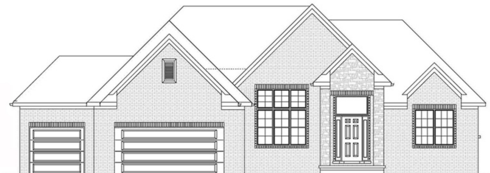
FRONT ELEVATION "C"