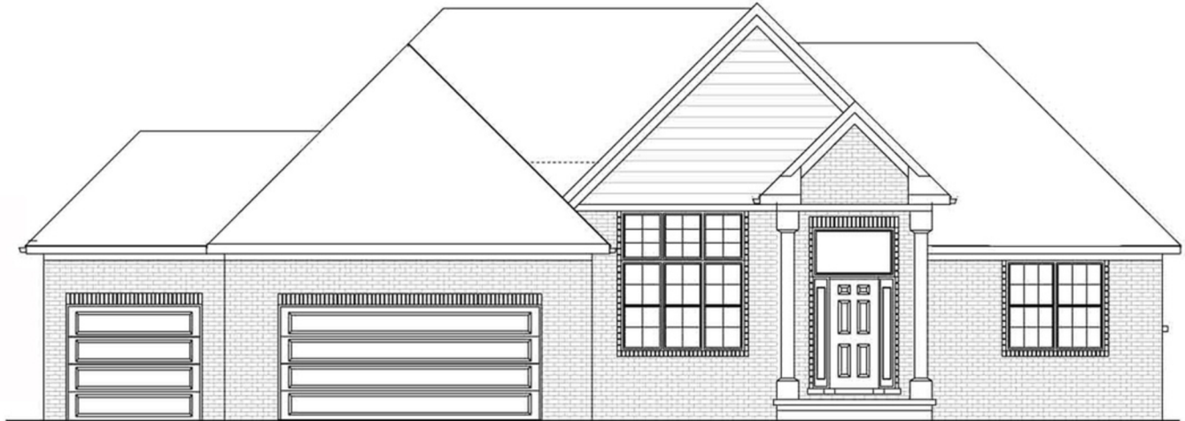
FRONT ELEVATION "A"