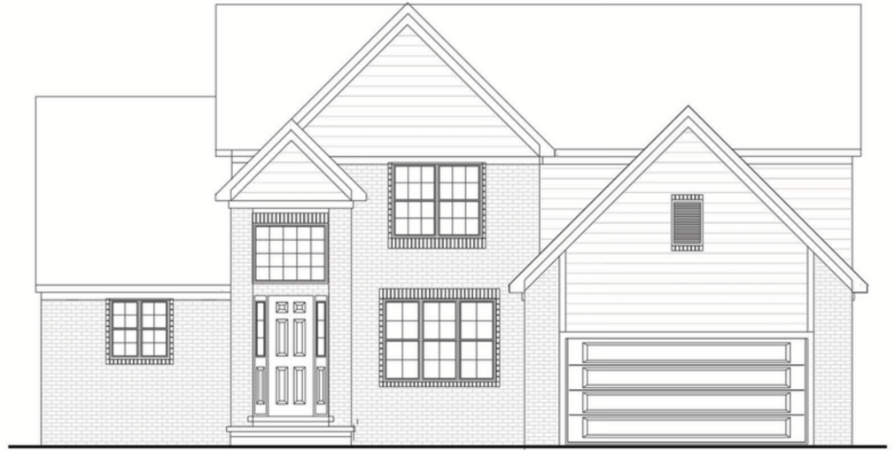
FRONT ELEVATION "A"