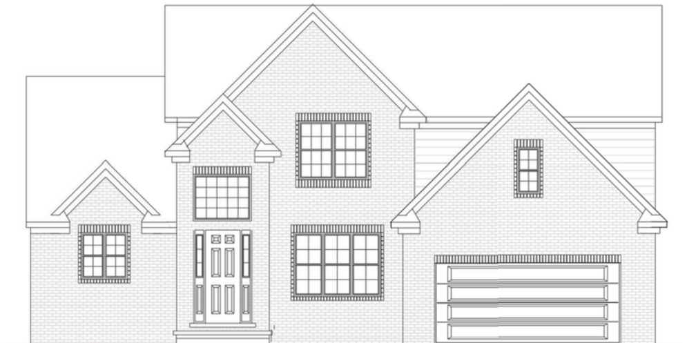
FRONT ELEVATION "C"